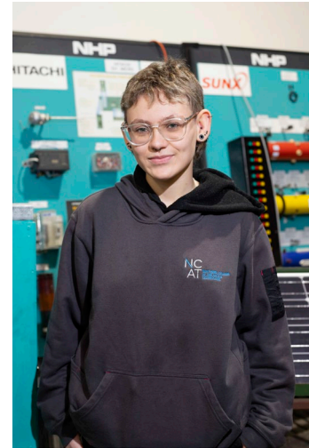
Nina ELECTRO TECHNOLOGY

For too long, far too long, women have been denied their right to a substantial place in Trade and Technology sectors by a broad range of complex factors. Currently women make up only 2% of the Construction Industry in Australia, the percentage has basically not changed since the 80s.